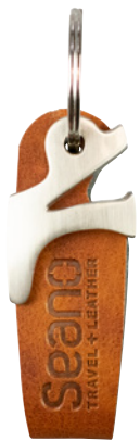
C1064 bottle opener