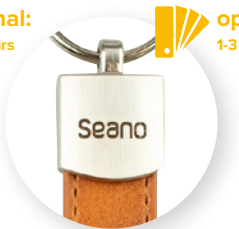
Metal embossing C1065