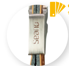
Metal embossing C1064